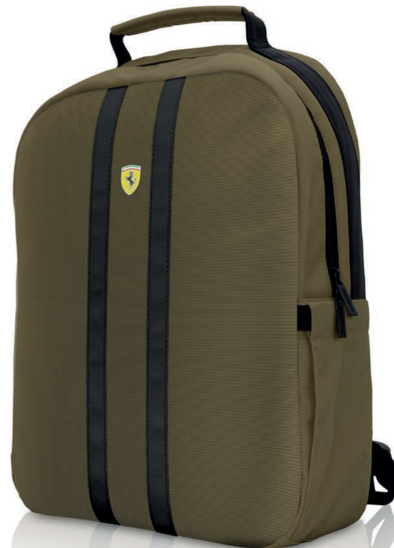
BACKPACK Kaki Nylon & Black PU Compatible 15" - FESLIBPS15KA