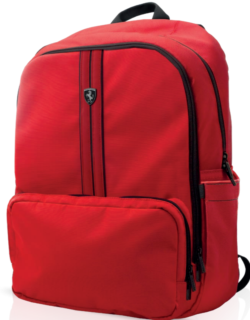
BACKPACK Red PU & Nylon

Compatible 15" with Front Pocket - FEURBP15BK