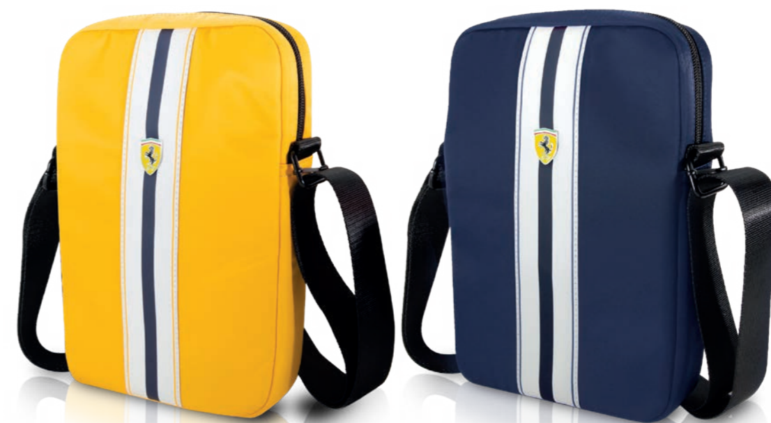
TABLET BAG Yellow Nylon