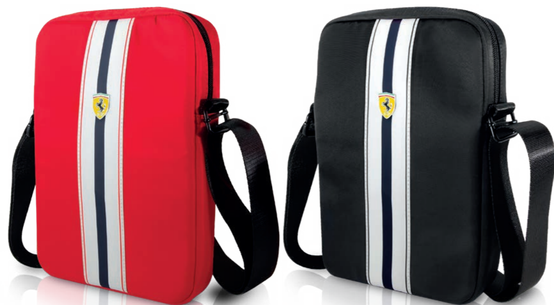
TABLET BAG Red Nylon