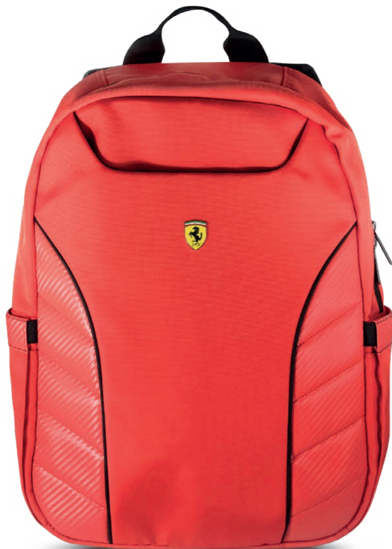
BACKPACK Red PU Carbon & Nylon Compatible 15" - FESRBBPCO15RE