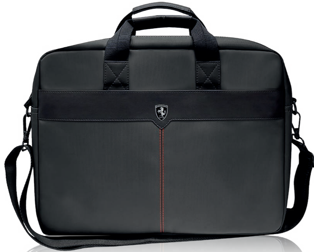
COMPUTER BAG Black Nylon & Black PU Compatible 15" - FEOCECB15BK