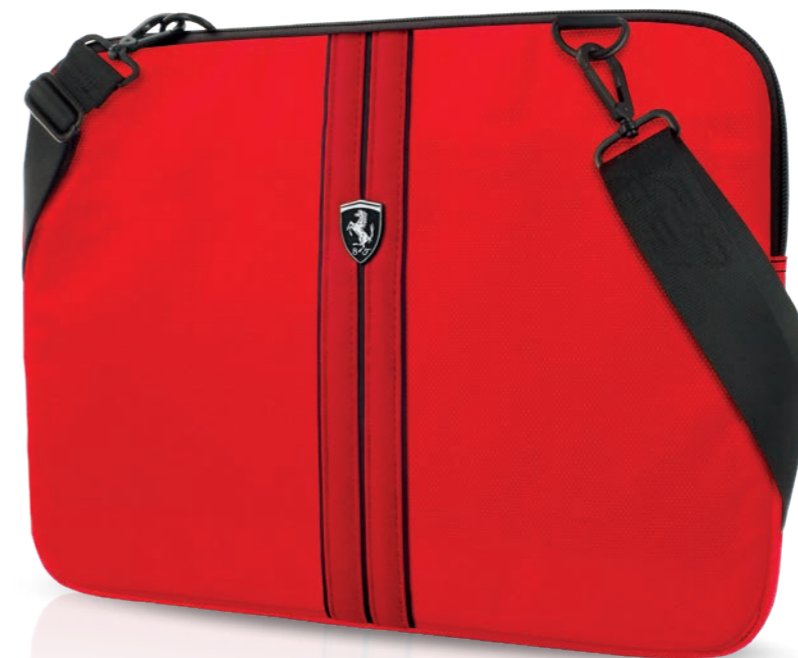
COMPUTER SLEEVE Red PU & Nylon

Compatible 11" Simple - FEURCS11RE Compatible 13" Simple - FEURCS13RE Compatible 15" Simple - FEURCS15RE