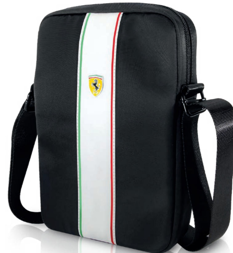
TABLET BAG Black Nylon