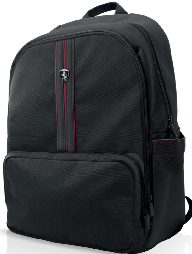
BACKPACK Black PU & Nylon

Compatible 15" with Front Pocket - FEURBP15RE