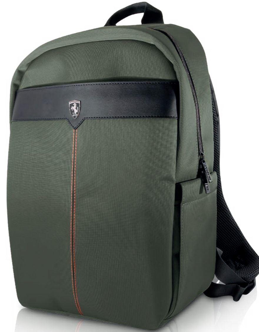
BACKPACK Kaki Nylon & Black PU Compatible 15" - FEOCEBP15KA