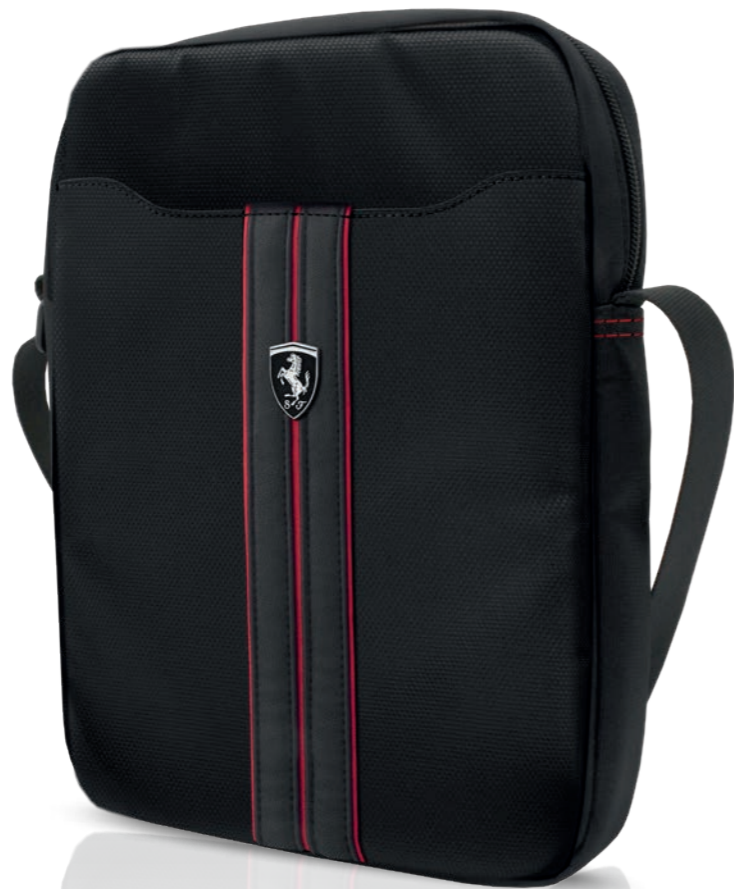
TABLET BAG Black PU & Nylon

Compatible 7" / 8" - FEURSH8BK Compatible 9" / 10" - FEURSH10BK