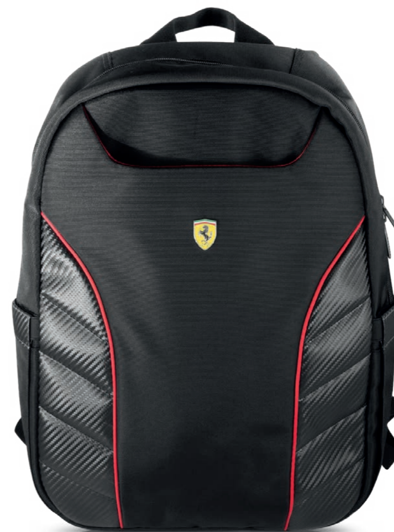
BACKPACK Black PU Carbon & Nylon Compatible 15" - FESRBBPCO15BK