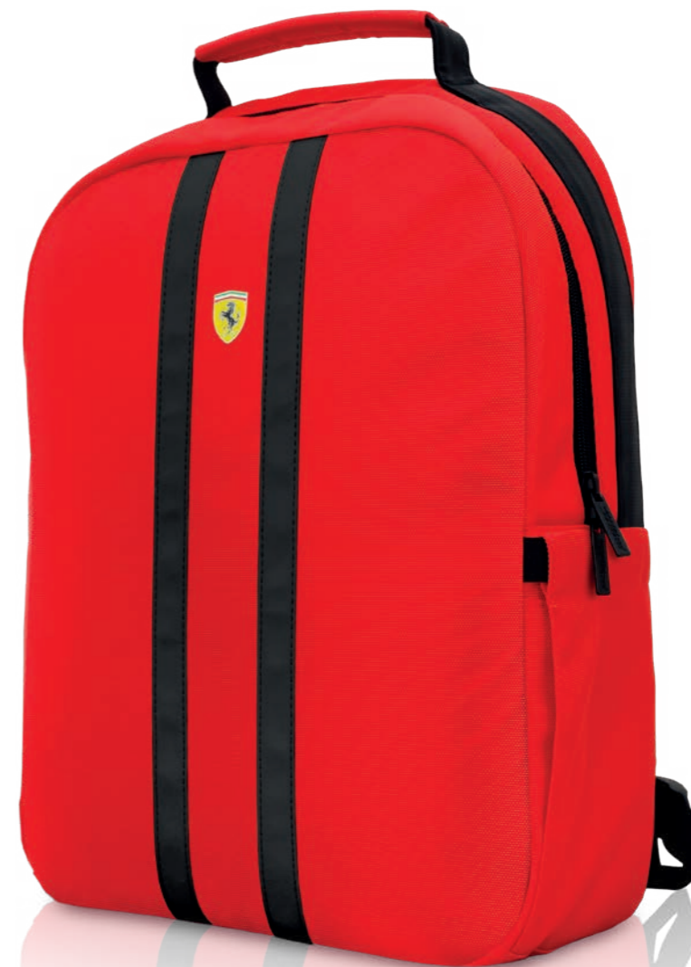
BACKPACK Red Nylon & Black PU Compatible 15" - FESLIBPS15RE