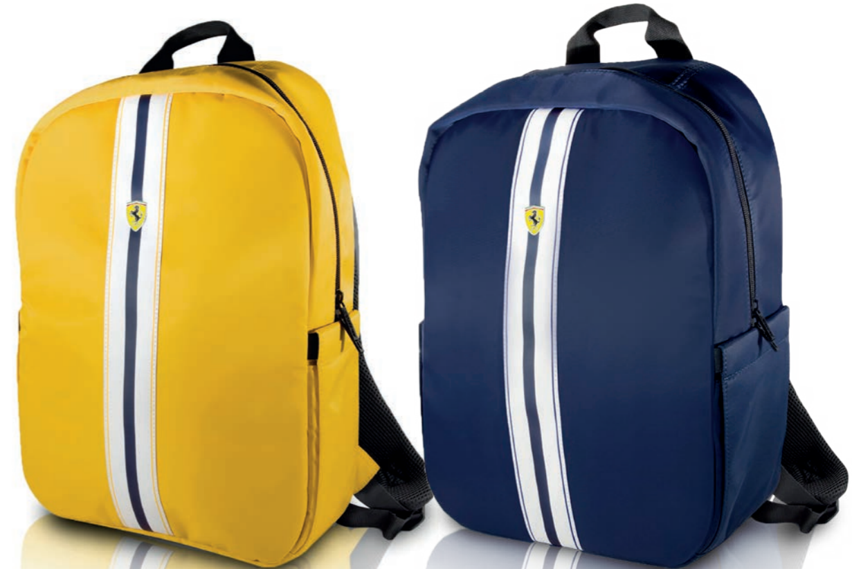
BACKPACK Yellow Nylon