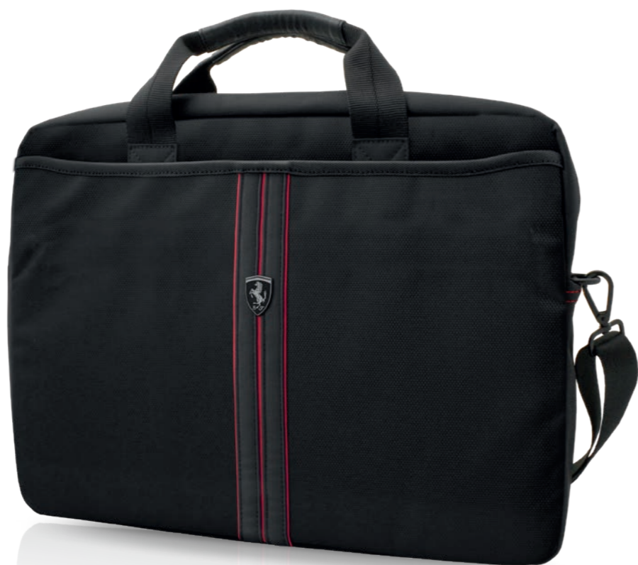
COMPUTER BAG Black PU & Nylon

Compatible 15" - FEURCB13BK Compatible 13" - FEURCB15BK