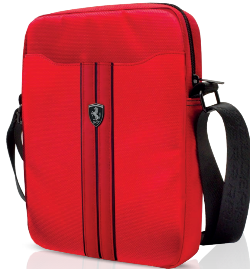
TABLET BAG Red PU & Nylon

Compatible 7" / 8" - FEURSH8RE Compatible 9" / 10" - FEURSH10RE