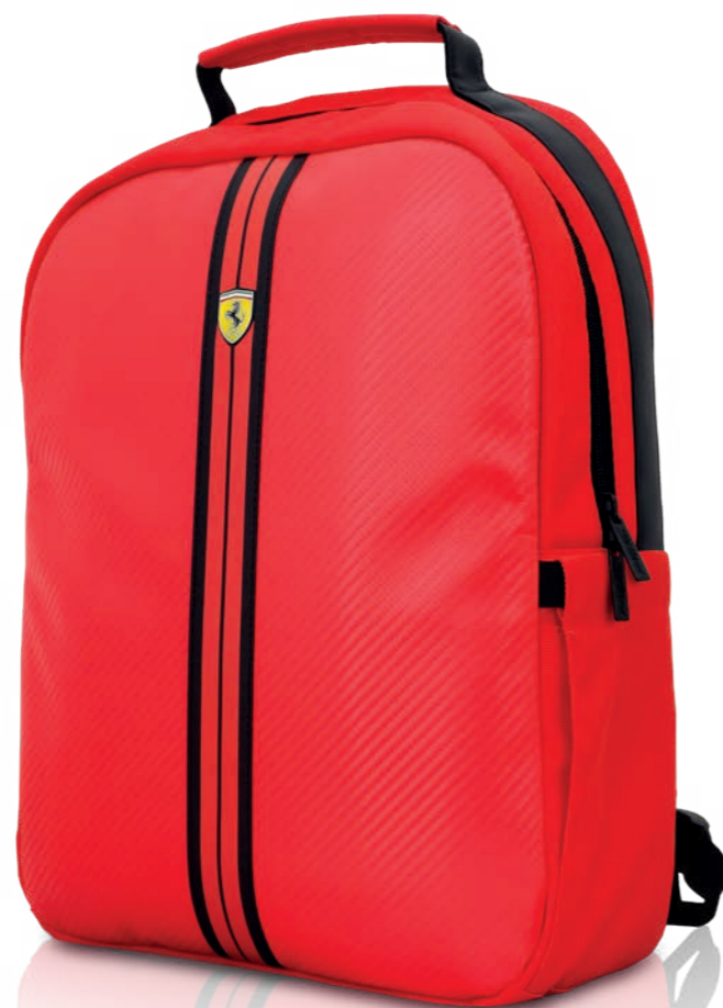
BACKPACK Red PU Carbon & Black PU