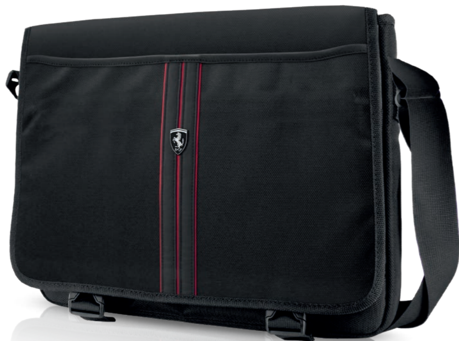
MESSENGER BAG Black PU & Nylon

Compatible 15" - FEURMB13BK Compatible 13" - FEURMB15BK