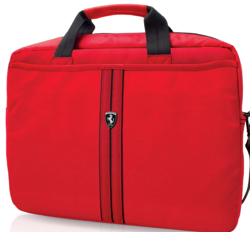
COMPUTER BAG Red PU & Nylon

Compatible 15" - FEURCB13RE Compatible 13" - FEURCB15RE