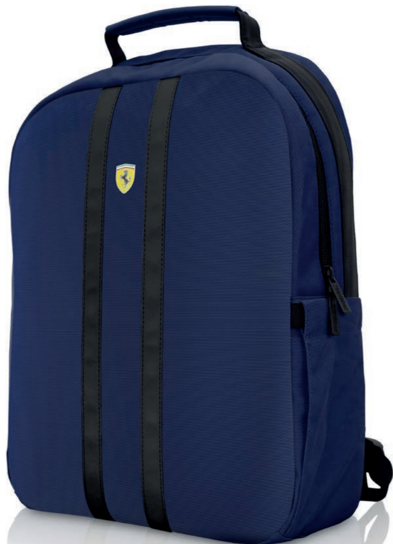
BACKPACK Navy Nylon & Black PU Compatible 15" - FESLIBPS15NA