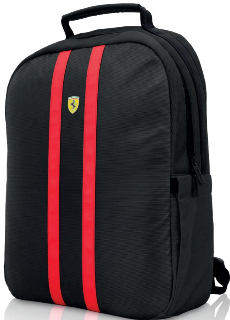
BACKPACK Black Nylon & Red PU Compatible 15" - FESLIBPS15BK