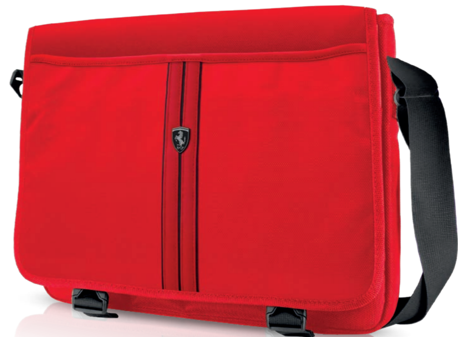
MESSENGER BAG Red PU & Nylon

Compatible 15" - FEURMB13RE Compatible 13" - FEURMB15RE