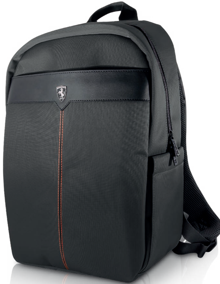
BACKPACK Black Nylon & Black PU Compatible 15" - FEOCEBP15BK