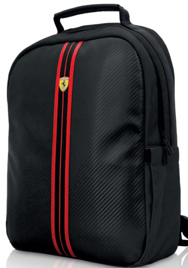
BACKPACK Black PU Carbon & Red PU