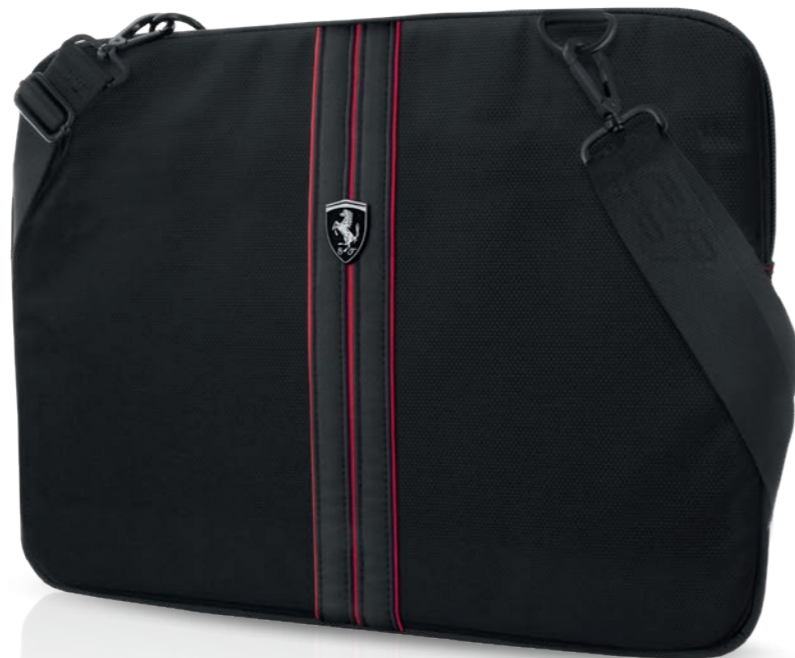
COMPUTER SLEEVE Black PU & Nylon

Compatible 11" Simple - FEURCS11BK Compatible 13" Simple - FEURCS13BK Compatible 15" Simple - FEURCS15BK