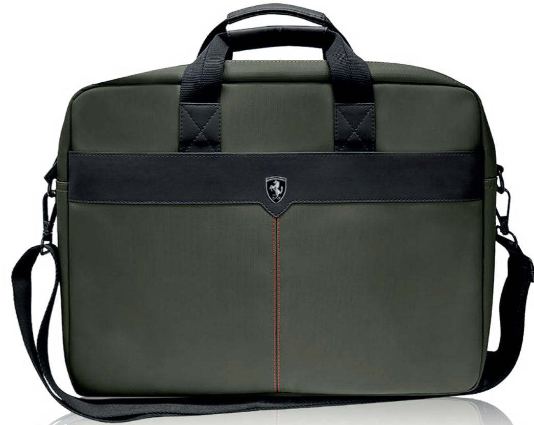
COMPUTER BAG Kaki Nylon & Black PU Compatible 15" - FEOCECB15KA