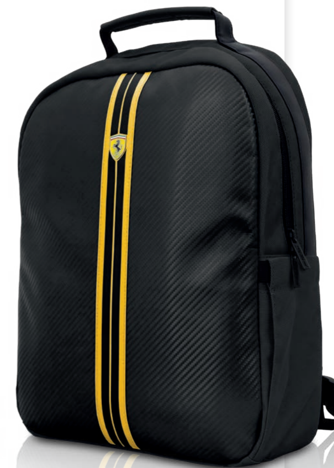
BACKPACK Black PU Carbon & Yellow PU