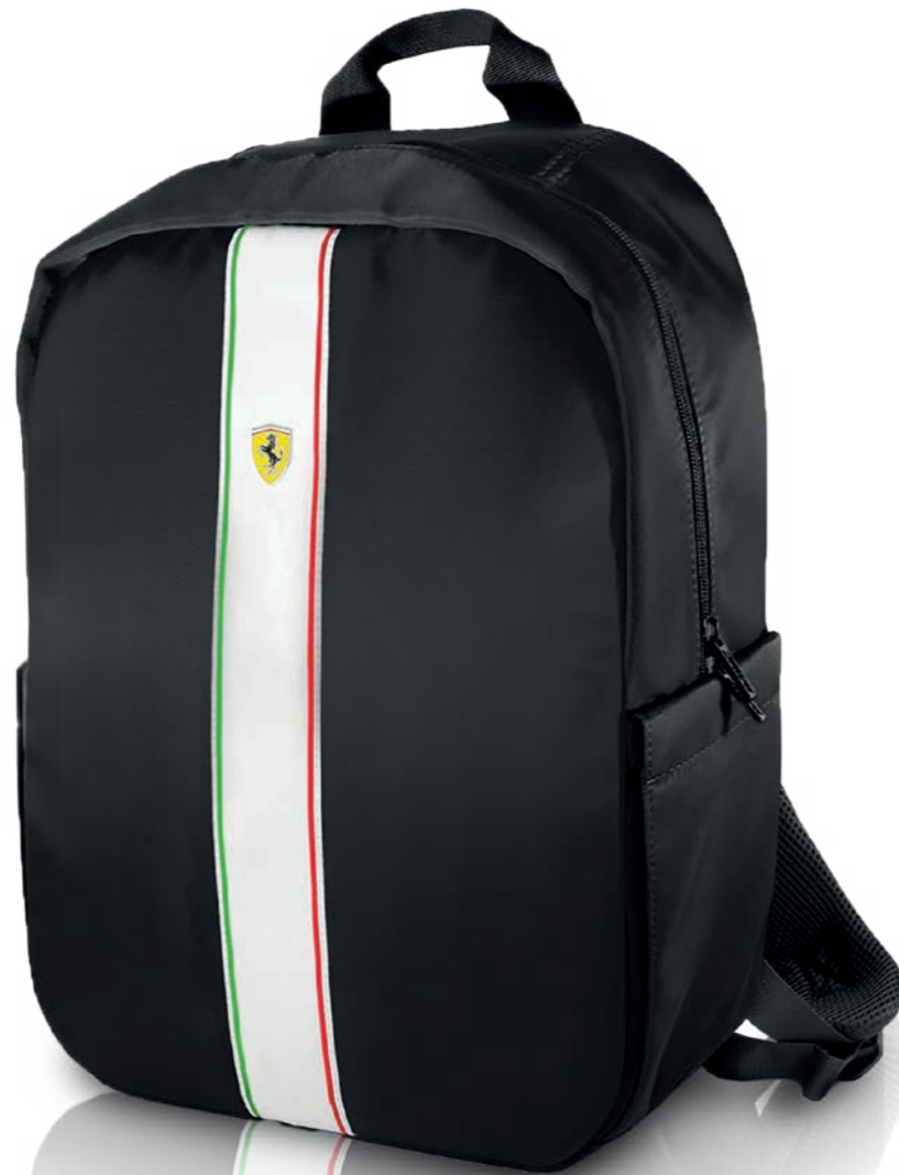
BACKPACK Black Nylon