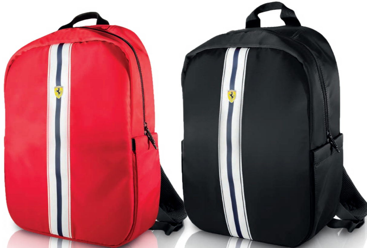
BACKPACK Red Nylon